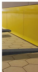
Heavy duty Skirting