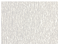
Embossed White | 85